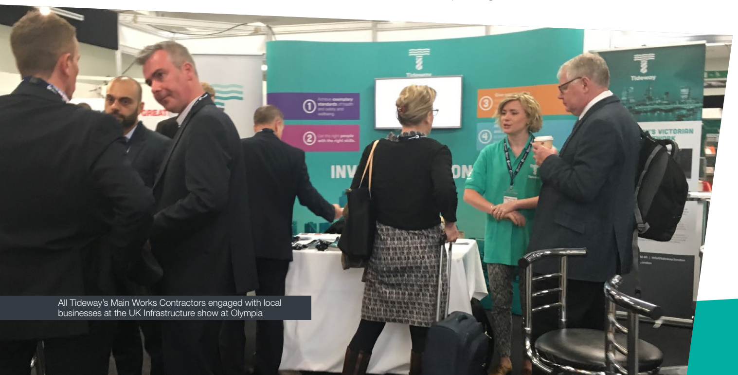
All Tideway's Main Works Contractors engaged with local businesses at the UK Infrastructure show at Olympia