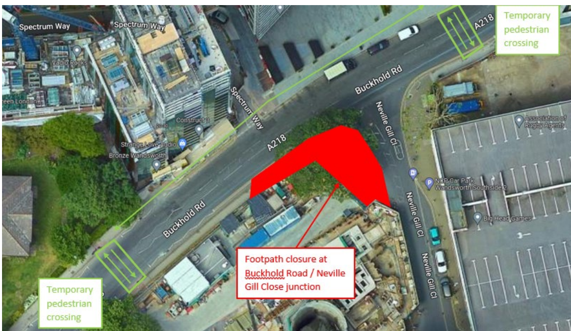
Phase 2 - 25 July 2022 to 12 August 2022