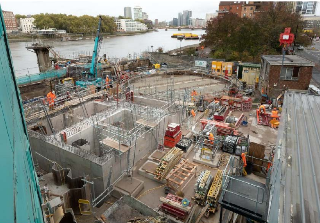
SWSR IC excavation