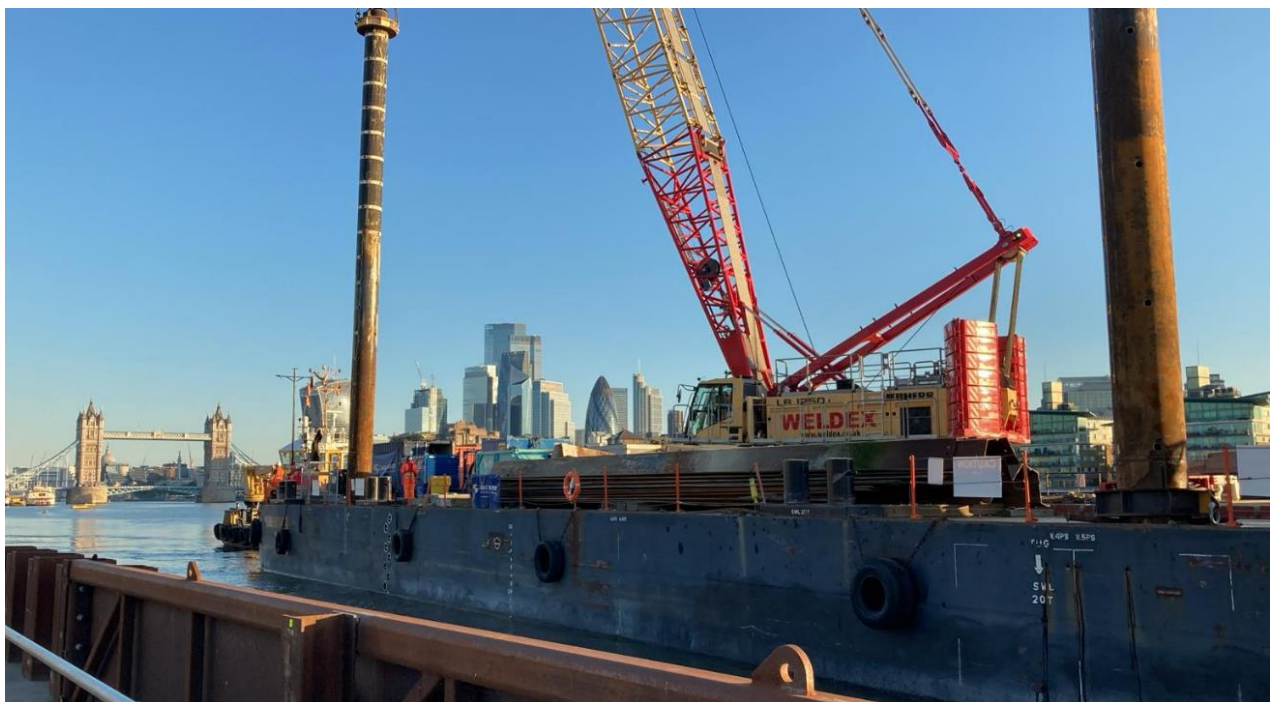
This picture shows the barge delivery of sheet piles from the Tideway King Edward Memorial Park site, which will be re-used at Chambers Wharf