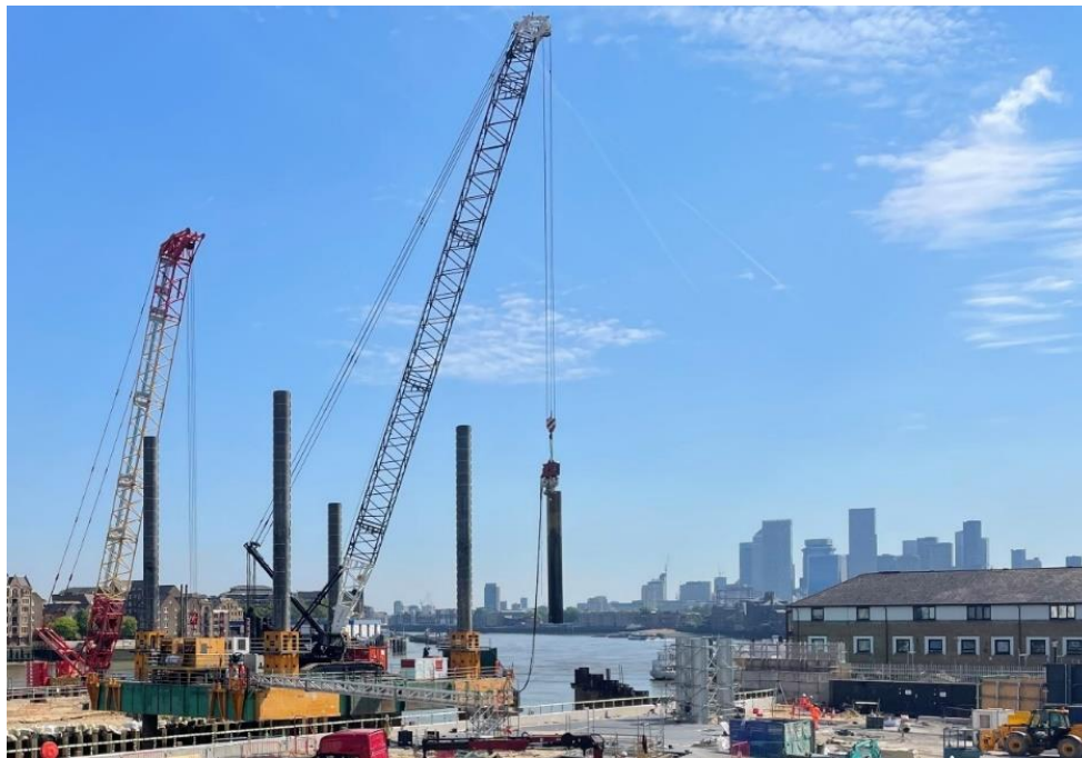
Picture shows the removal of a pile from the eastern side of the cofferdam

Tidally affected activities, such as river wall panel installation and cofferdam removal, may take place from 5am to 10pm. This includes excavation, cell dismantling, stockpiling materials, lifting activities plus barge loading and movements. We do not plan any noisy activities after 6pm.